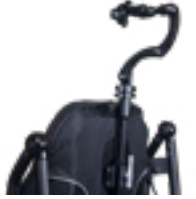
GT Lateral Hardware Shown on Acta-Back®

Company Name/ACCT #: _____ P.O. Number: _____ Requested By: _____ Phone: _____ Fax: _____ Email: _____ Ship To: _____ Patient Reference: _____