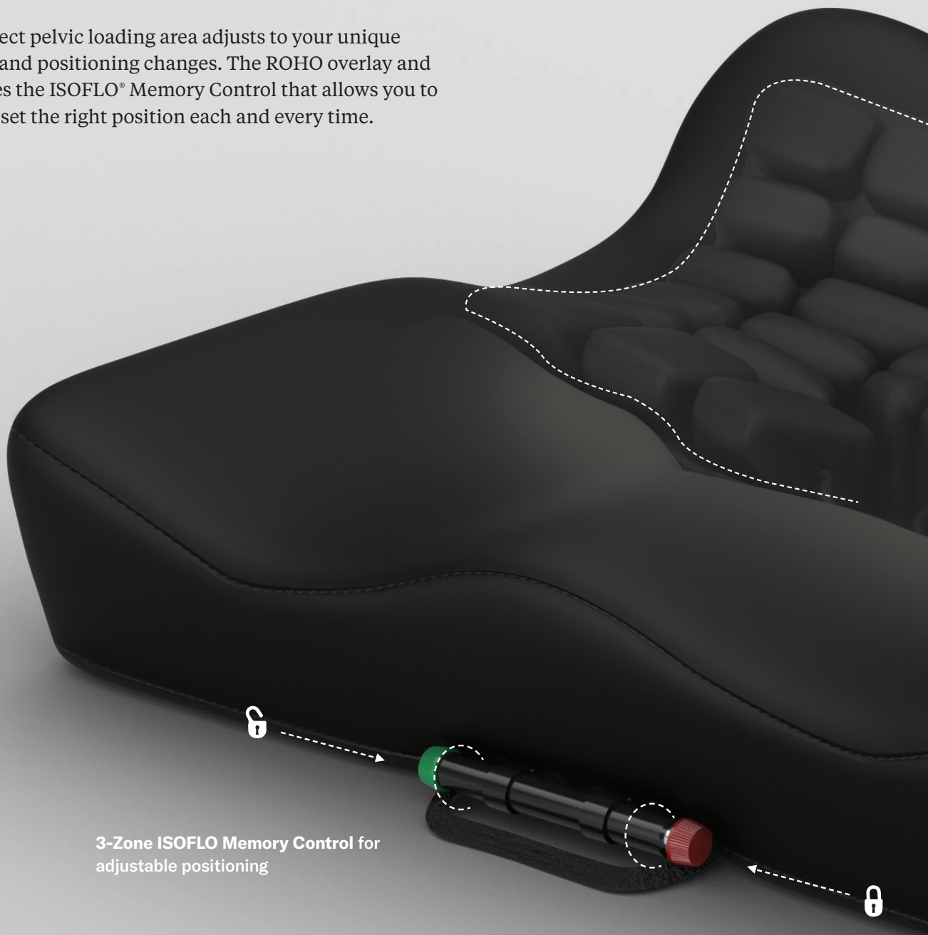
3-Zone ISOFLO Memory Control for adjustable positioning

The Hybrid Select pelvic loading area adjusts to your unique shape, weight, and positioning changes. The ROHO overlay and IT insert utilizes the ISOFLO® Memory Control that allows you to easily find and set the right position each and every time.