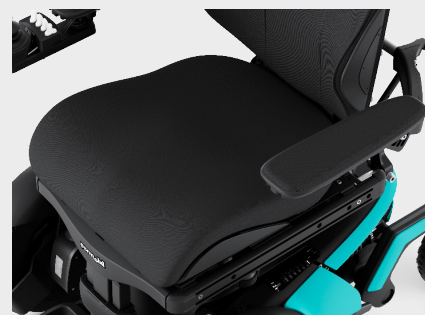
Corpus ERGO Cushion