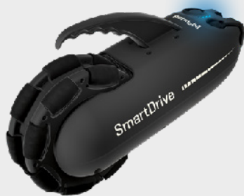
SmartDrive MX2+ Power Assist