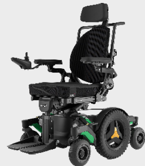
M1 Mid Wheel Drive