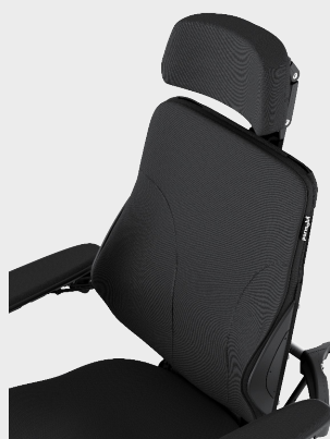
Corpus ERGO Back