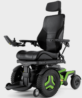
F3 Corpus Front Wheel Drive