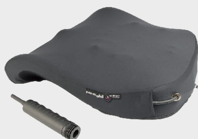
Corpus ERGO Air Cushion