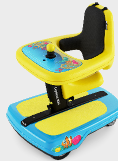
Explorer Mini Paediatric