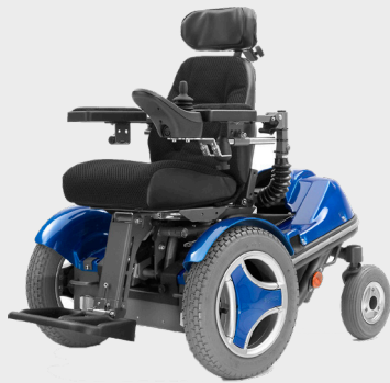
Explorer Mini Paediatric