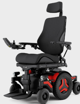
M3 Corpus Mid Wheel Drive