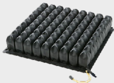
ROHO Single Valve