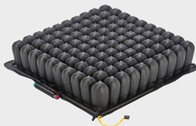
ROHO Quadtro Select