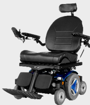
M300 HD Mid Wheel Drive