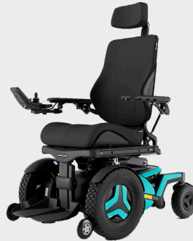
F5 Corpus Front Wheel Drive