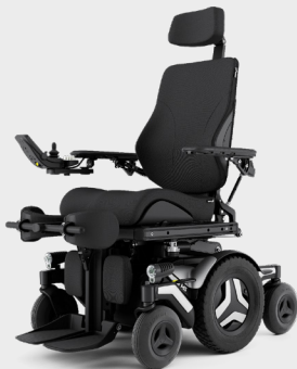
M5 Corpus Mid Wheel Drive