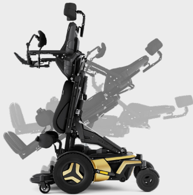
F5 Corpus VS Front Wheel Drive