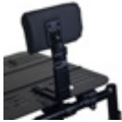
Lateral Pelvic Thigh Support with GT Slot Mount Removable Hardware Shown on Removable Solid Seat Pan

*Since U.S. Medicare coding is subject to change, the provider should always confirm the HCPCS code and coverage criteria as part of the client assessment process.*