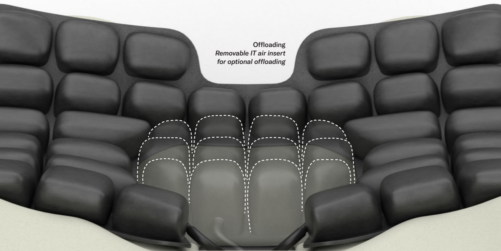
Offloading Removable IT air insert for optional offloading

The Hybrid Select provides flexibility and forgiveness that other offloading cushions do not, making it easier to be in the right position each and every time. The Hybrid Select offers an exclusive optional offloading technique by removing the ischial tuberosities (IT) air insert.