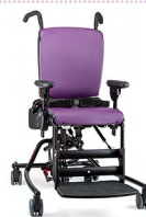
Large hi/lo base R870 Rifton Activity Chair