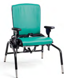
Large standard base R860 Rifton Activity Chair