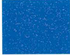
Ocean Blue Metallic