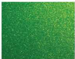
Acid Green Metallic