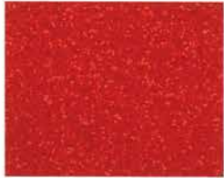
Salsa Red Metallic