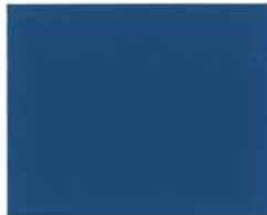
Deep Blue Ice