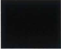
Super Wet Black