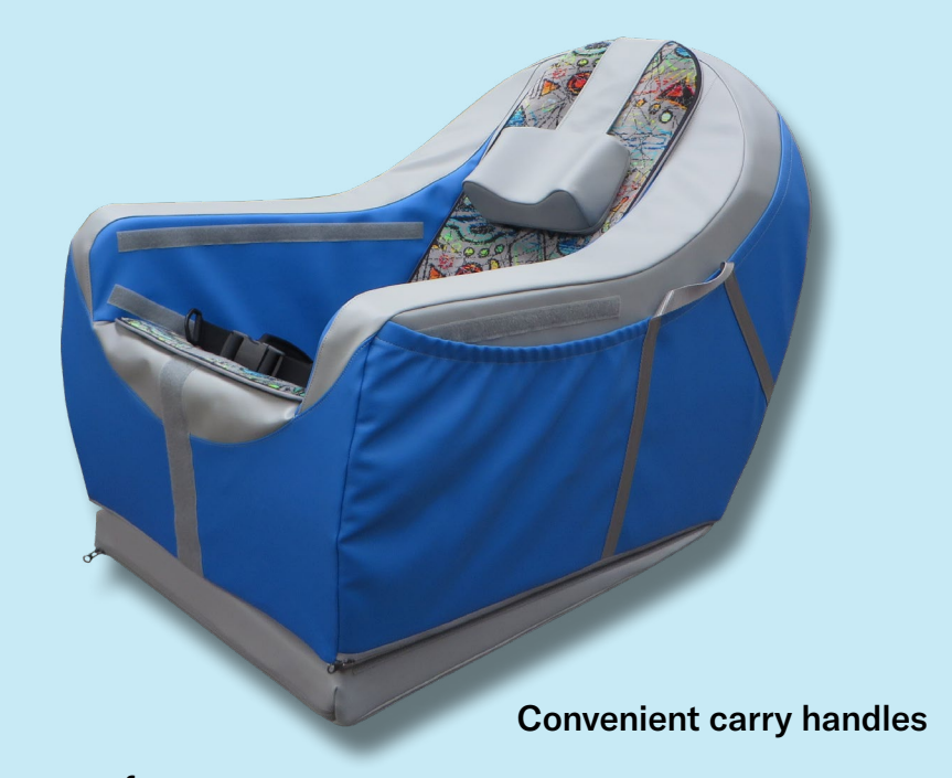
A range of accessory options