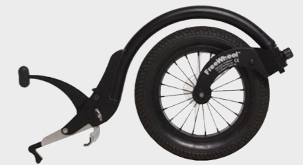
FreeWheel Wheelchair Attachment