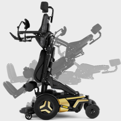
F5 Corpus VS Front Wheel Drive