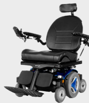
M300 HD Mid Wheel Drive