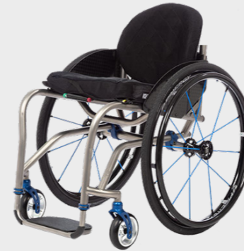
TiLite Rigid Dual Tube