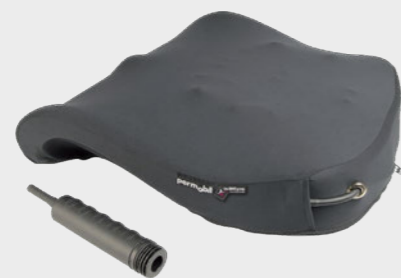
Corpus ERGO Air Cushion