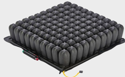
ROHO Quadtro Select High Profile