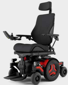
M3 Corpus Mid Wheel Drive