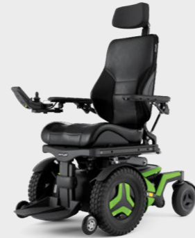
F3 Corpus Front Wheel Drive