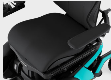
Corpus ERGO Cushion