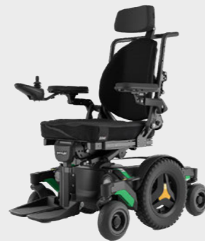
M1 Mid Wheel Drive