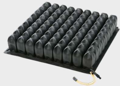
ROHO Single Valve High Profile