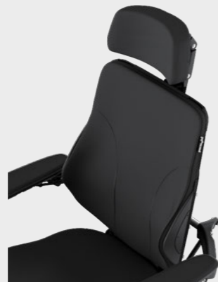
Corpus ERGO Back