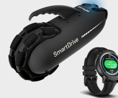
SmartDrive MX2+ Power Assist