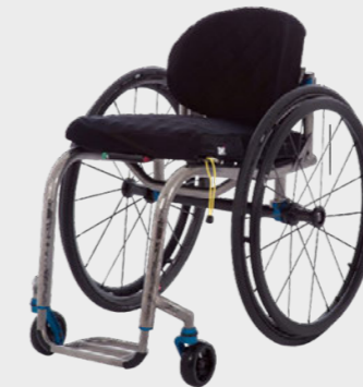
TiLite Rigid Mono Tube