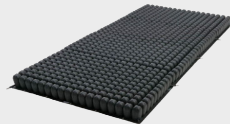
ROHO Dry Floatation Mattress