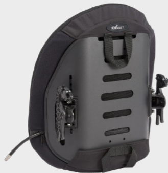
ROHO Agility Back