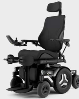
M5 Corpus Mid Wheel Drive