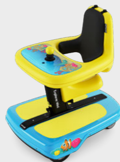
Explorer Mini Paediatric